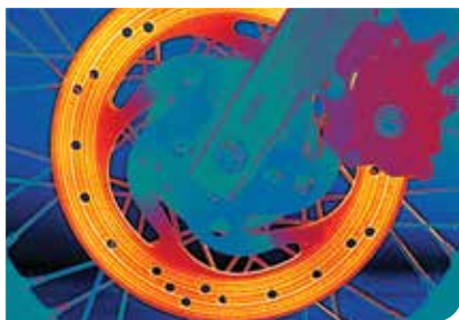
Motorcycle disc brake system